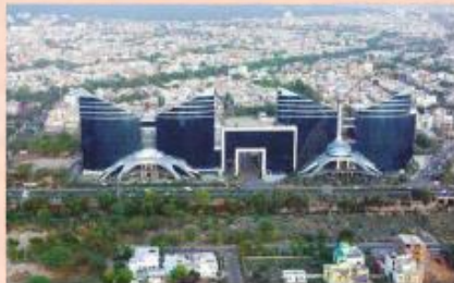
WORLD TRADE PARK