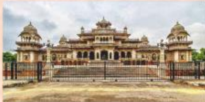
ALBERT HALL MUSEUM