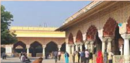
GOVIND DEVJI TEMPLE