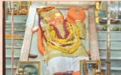
KHOLE KE HANUMAN JI